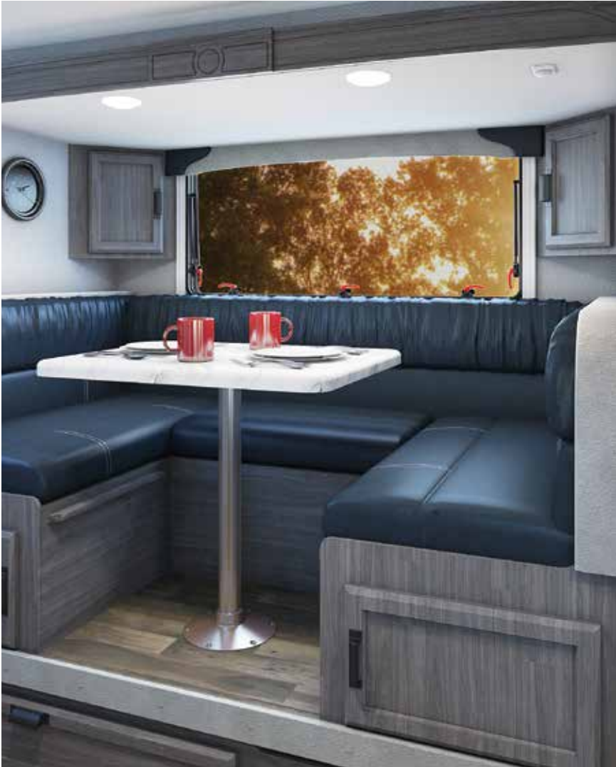
1575 shown in ROYAL