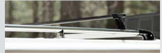
Exclusive Lance Load roof rack system safely stores your canoe, kayak, paddle boards...etc. - N/A 1475 & 1575