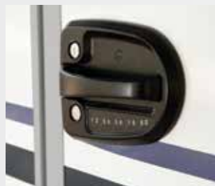
Keyless entry lets you adventure out without having to worry about your keys when you enter your trailer using a personalized code.