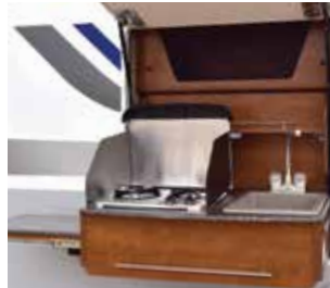
Exterior kitchen w/dual burners & sink take cooking duties outside. - 2295, 2075, 2445