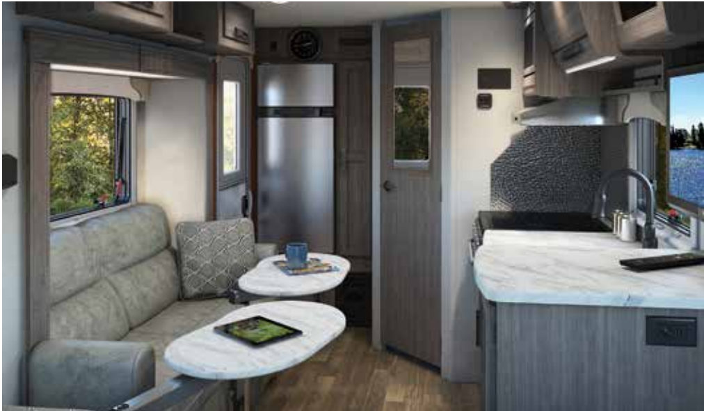
1475 shown in PLATINUM