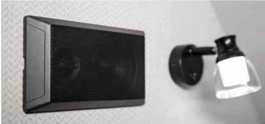
2445 Flush mounted speaker and reading light