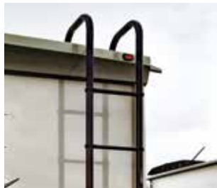
Walk on roof allows for worry free maintenance. N/A 1475 & 1575