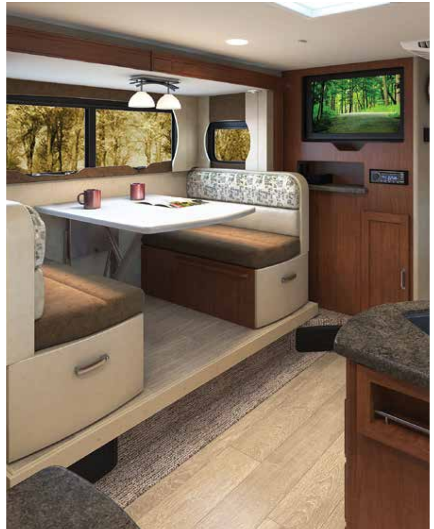
2375 shown in MYSTIC SHORES