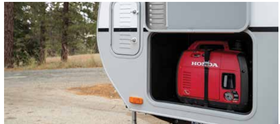
Portable generator storage compartment complete with tie down strap. - N/A 1475, 1575, 2465