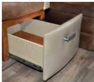
Large lockable dinette storage drawers utilize residential dovetail construction for strength. - N/A 1475, 1575, 2075