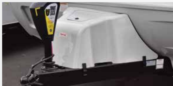
Tri-Five Propane Tanks allow for extended stays while an aerodynamic cover looks stylish and keeps tanks protected and out of sight. - N/A 1475 & 1575