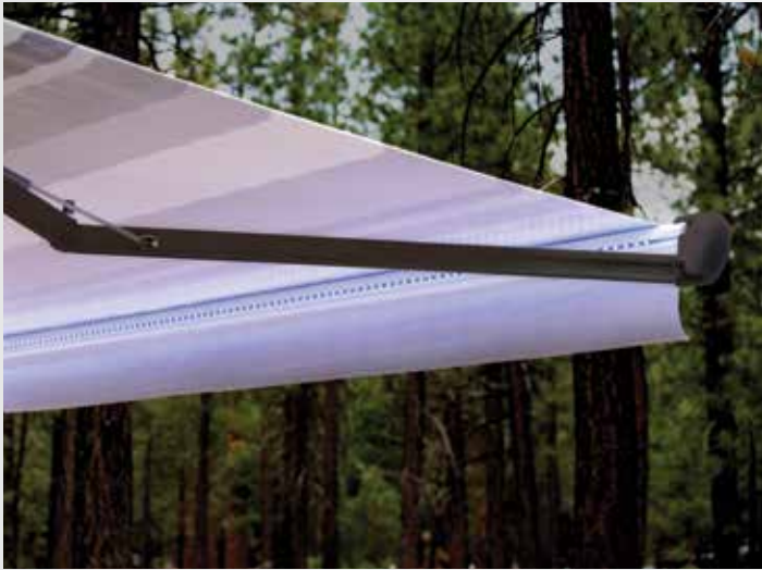
Latitude power awning provides unobstructed shade with direct response wind sensor & LED light bar.