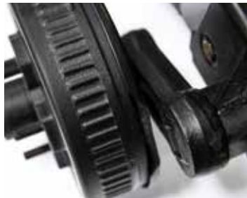
Standard torsion axle provides independent articulation of each tire allowing for a smoother ride.