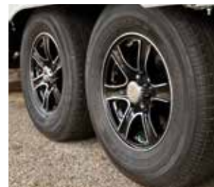
Aluminum wheels & nitrogen filled USA manufactured Goodyear radial tires keep the good times rolling.