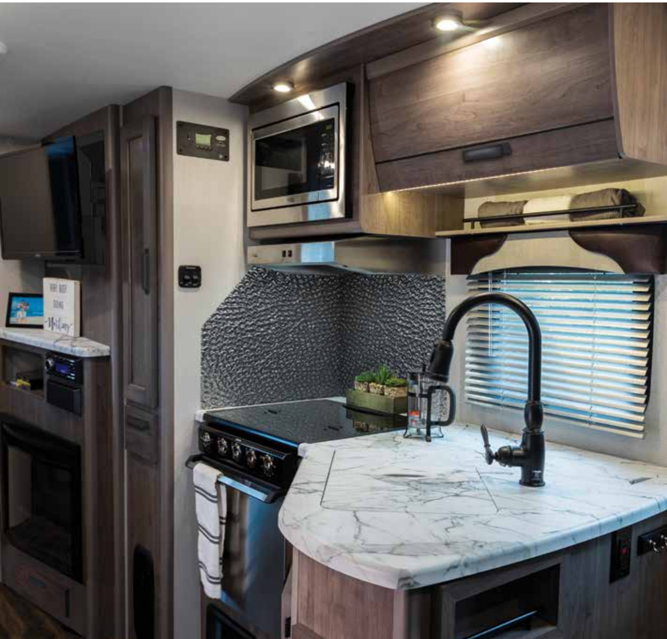
2445 shown in Java