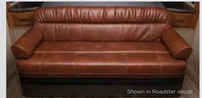
Shown in Roadster décor