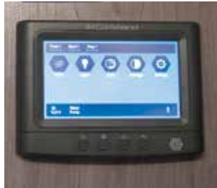
IN-Command brings smart home technology to your RV by connecting you with many of the systems through an app. (2075, 2445)