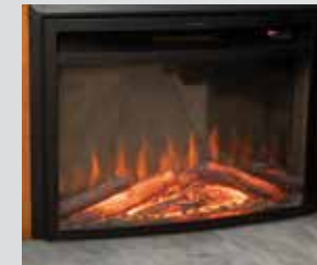
Electric fireplace provides ambiance & radiant heat. - 2295, 2445, 2465