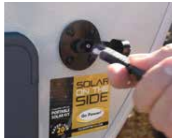
Standard Solar on the Side SAE port accepts external aftermarket solar panels to keep your 12v system charged.