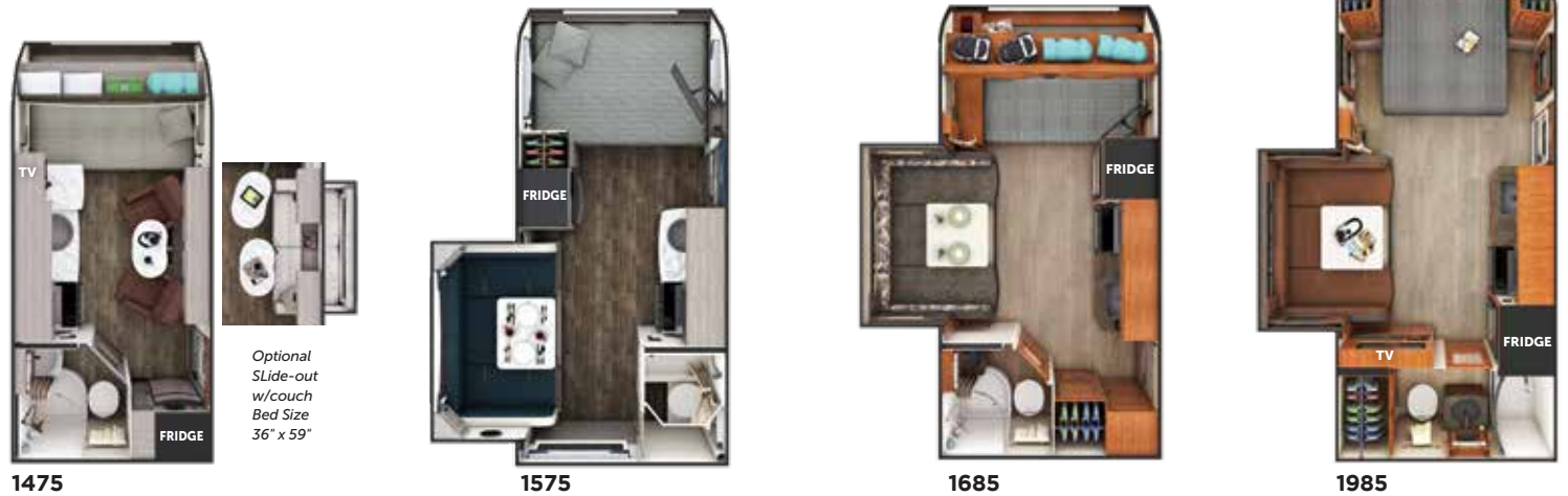
Optional Sofa Bed

** When looking at cargo capacity you must consider the hitch weight of the trailer and axle capacity. Hitch weight is actually being hauled while the remaining Trailer weight on the axle(s) is being towed. Example if a trailer has a total weight of 4000 pounds with a 400 pound hitch weight that would mean 3600 pounds is on the axle(s). If the axle weight rating is 5200 for this unit you will have 1600 of axle capacity for cargo