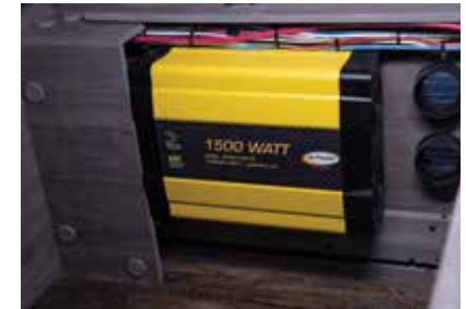
Optional 1500w inverter allows your battery-based system to run conventional appliances by inverting 12V DC to create 120V AC output. - N/A 2465