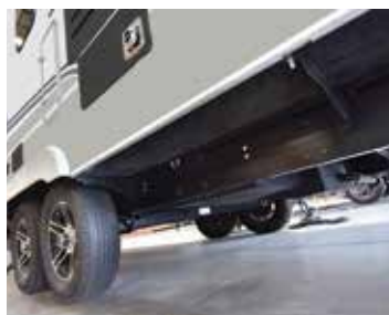
Standard HSLA e-coated frame protected against the mud, dirt and elements.