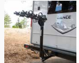
1 1/4" receiver gives you another area to haul your gear including bikes, skis, snowboards, etc. - Limit 130 lbs. - N/A 1475 & 1575