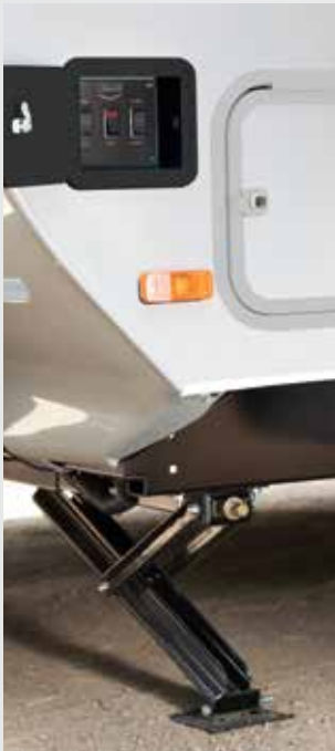
Electric stabilizer jacks with foot pads make set up & teardown sweat free, keeping your trailer stabilized while parked. - N/A 1475 & 1575