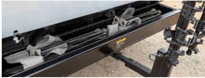
Rear bumper storage compartment provides space for your sewer hose or camp chairs. 2075