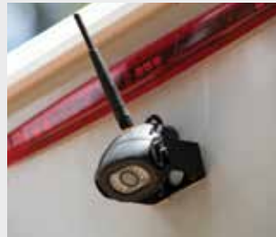
Backup camera w/color display and sound makes backing up a safer, one-person job.