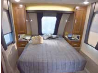
60" X 80" Residential Queen Beds