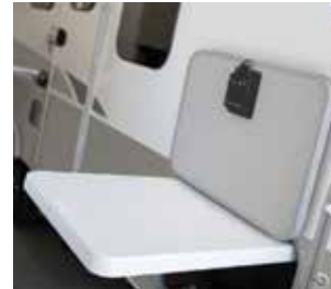
Lance Life 4' exterior table. We all need one & this one doesn't waste space. N/A 1475, 1575, 2465