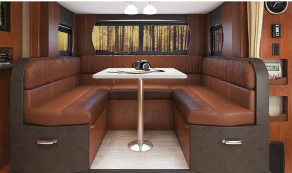
1985 shown in ROADSTER