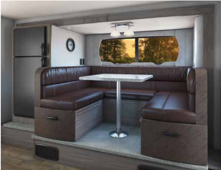
2445 shown in JAVA