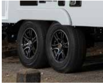
Optional 2 5/8" lift kit offers additional ground clearance for your off the pavement adventures.