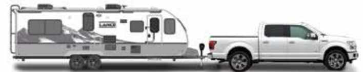
Models: 1475, 1575, 1685, 1985, 1995, 2075, 2185, 2285, 2295, 2375, 2445, 2465