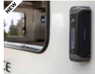
Portable Bluetooth speaker keeps the tunes rolling in or out of the trailer. (1475, 1575, 2075, 2445)