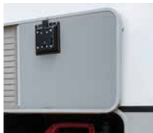
Magnetic exterior latches stay in place for hands free access.