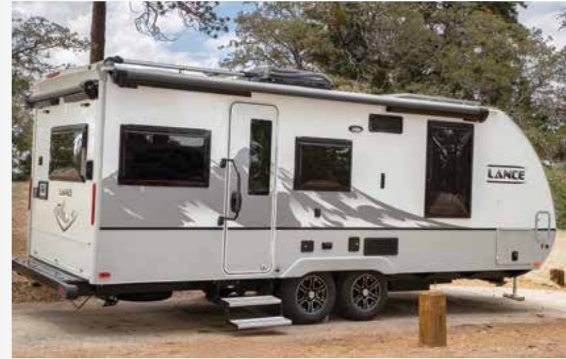
Mountain Scene graphics give you a fresh look inspired by adventure.