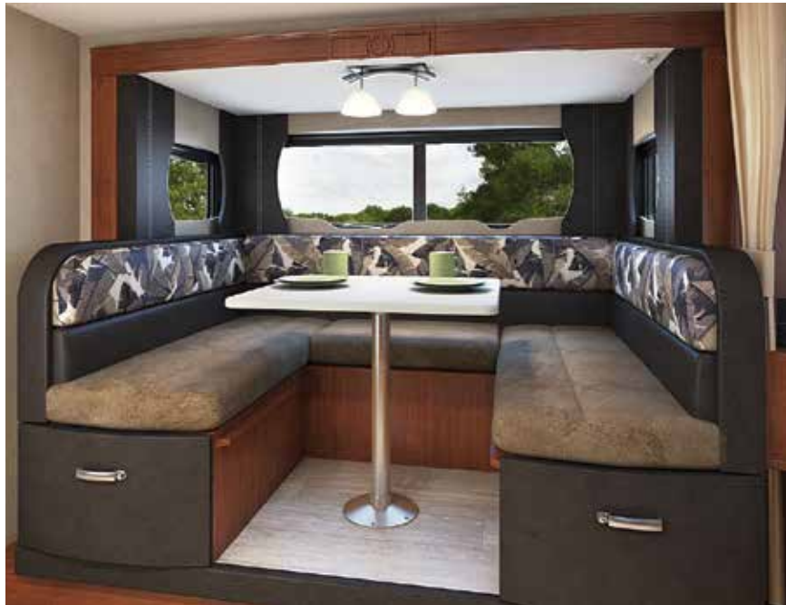
1685 shown in PASSAGE