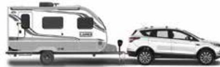
Models: 1475, 1575