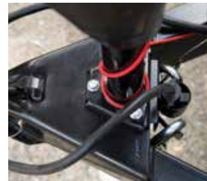
Electric cord and chain caddy. Keep these items off the ground.