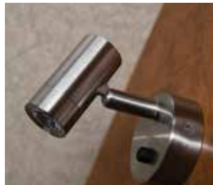
100% LED lighting brightens your trailer and is easy on your power supply.