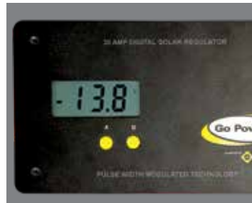
Optional solar panel charge monitor and automatic controller keep you informed. -Included with panel(s).