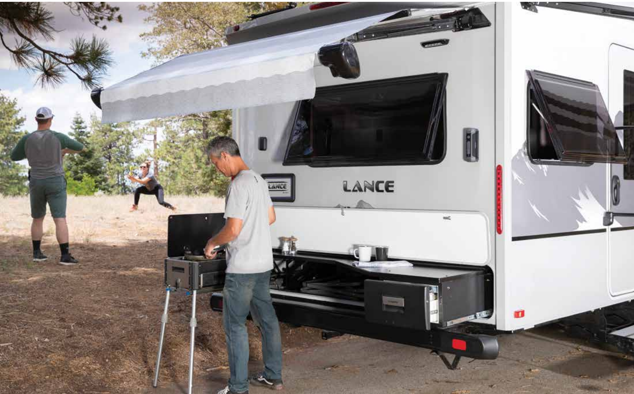
2075 with optional exterior rear kitchen and mountain scene graphics.