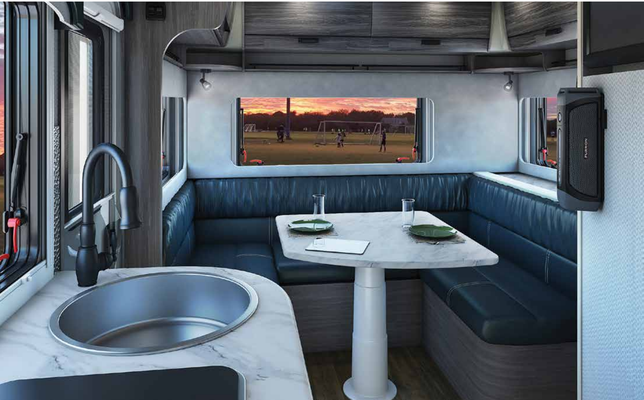
2075 shown in Royal