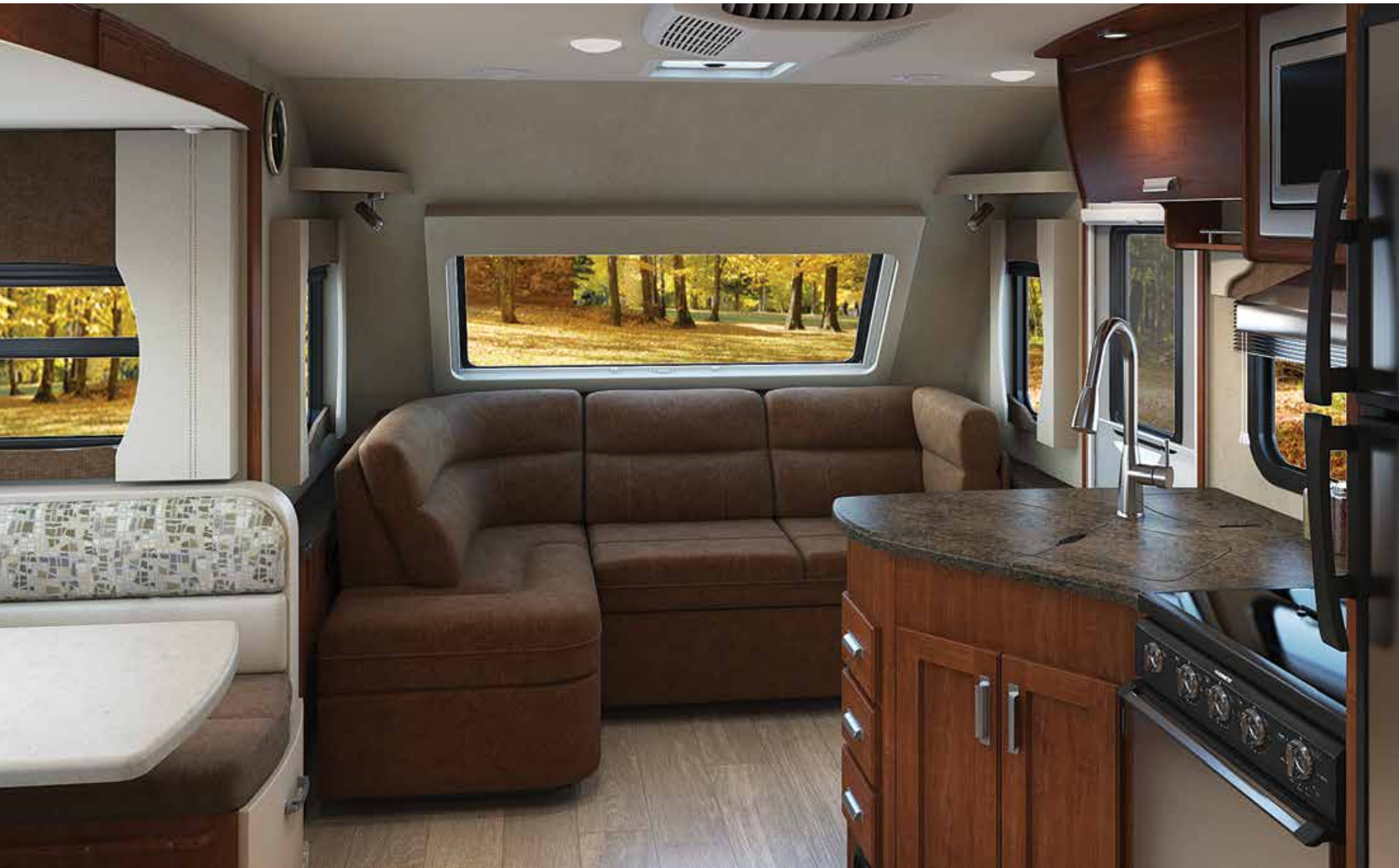
2465 shown in Mystic Shores