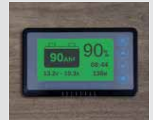
Upgraded battery monitor displays battery statistics like amp-hours consumed, state of charge, and voltage.