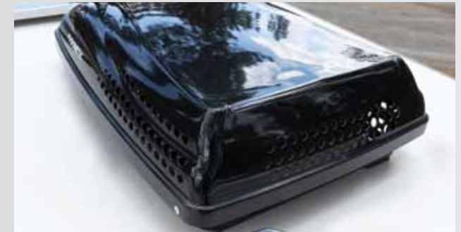
Dometic Penguin II 10K low profile a/c runs on 2,200w generator allowing for off the grid cooling.