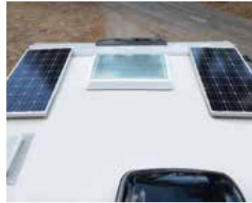
Optional 190w roof mounted solar panel (up to 2) keeps you and your accessories charged.