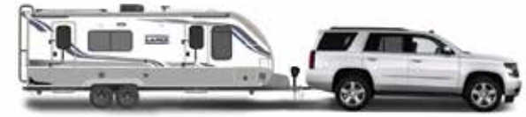
Models: 1475, 1575, 1685, 1985, 1995, 2075, 2185, 2285, 2295