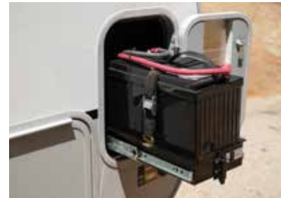
Optional lithium battery (up to 2) brings cutting edge battery technology to your RV.