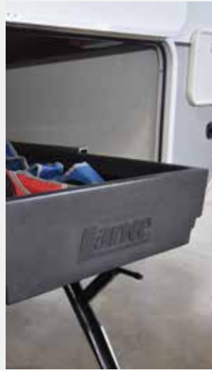
Pull out front storage tray organizes & provides easy access to your gear. - N/A 2465